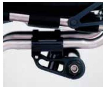
Rear suspension system features a dual uni-pivot polymer unit. Adds less than one pound of weight.